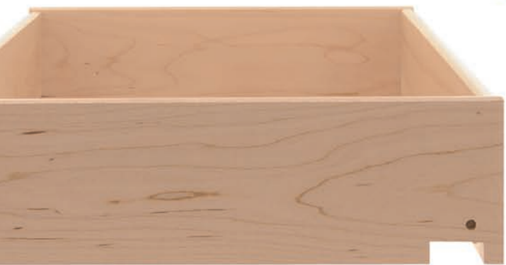
◀ NOTCH, DRILL & CLIPS