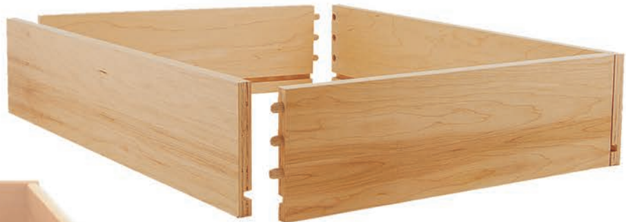
▼ DOWEL CONSTRUCTION