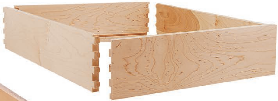
▼ DOVETAIL CONSTRUCTION