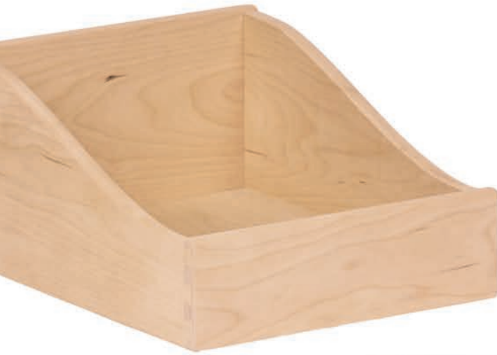
◀ SCALLOPED SIDES scoops optional