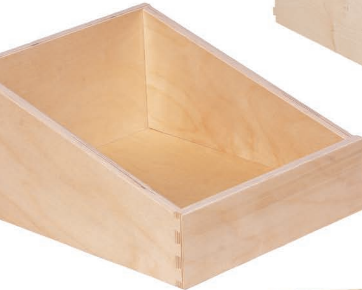
◀ ANGLED SIDES scoops optional