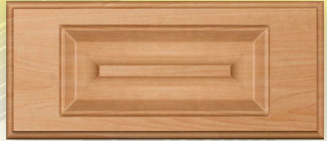
ROUTED DRAWER FRONT (Order As CM 1210) Minimum Height: 5-1/2" with 1-3/4" Rails

Construction Method: CNC Machined w/ MDF Core Outside Edge Detail: CF-2 Route Detail: CM 1210 w/ Cathedral Arch Minimum Width: 10-1/2" Minimum Height: 10" Max Width: 36" Max Height: 72"