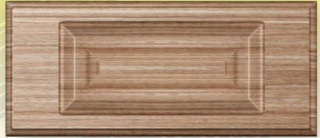
ROUTED DRAWER FRONT (Order As CM 842) Minimum Height: 7-3/4" with 1-3/4" Rails

Construction Method: CNC Machined w/ MDF Core Outside Edge Detail: CF-150 Route Detail: CM 842 w/ Cathedral Arch Minimum Width: 10-1/2" Minimum Height: 10" Max Width: 36" Max Height: 72"