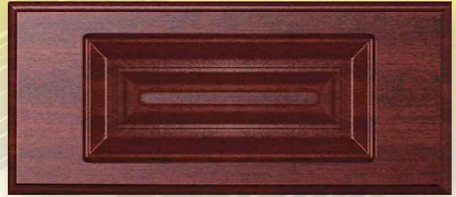
ROUTED DRAWER FRONT (Order As CM 842) Minimum Height: 7-3/4" with 1-3/4" Rails

Construction Method: CNC Machined w/ MDF Core Outside Edge Detail: CF-150 Route Detail: CM 842 w/ Continuous Arch Minimum Width: 9" Minimum Height: 10" Max Width: 36" Max Height: 72"