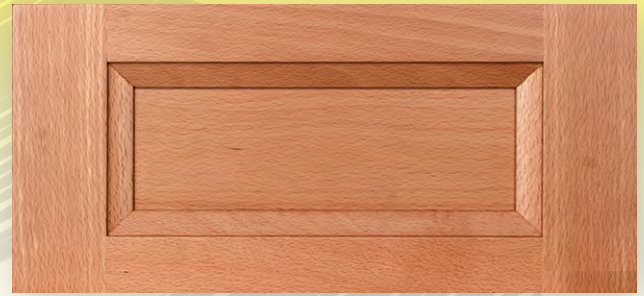
5-PIECE DRAWER FRONT (Solid Recessed Panel) Minimum Height: 6" with 1-1/2" Rails

Construction Method: Cope-N-Stick Outside Edge Detail: OD-6 (Square No Lip) Inside Edge Detail: Acuario Panel Detail: Hart Minimum Width: 8" Minimum Height: 8" Max Width: 26" Max Height: 72"