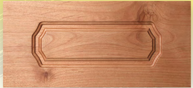
ROUTED DRAWER FRONT Minimum Height: 4-1/2"

Construction Method: Cope-N-Stick Outside Edge Detail: OD-6 (Square No Lip) Inside Edge Detail: Priscilla Panel Detail: Huntington Minimum Width: 9" Minimum Height: 9-1/2" Max Width: 26" Max Height: 72"