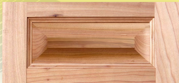
5-PIECE DRAWER FRONT Minimum Height: 6" with 1-1/2" Rails

Construction Method: Cope-N-Stick Outside Edge Detail: OD-6 (Square No Lip) Inside Edge Detail: Astron Panel Detail: Huntington Minimum Width: 7-1/2" Minimum Height: 7-1/2" Max Width: 26" Max Height: 72"