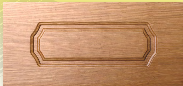
ROUTED DRAWER FRONT

Construction Method: Cope-N-Stick Outside Edge Detail: OD-6 (Square No Lip) Inside Edge Detail: Priscilla Panel Detail: 1/4" Recessed Minimum Width: 9" Minimum Height: 8-1/4" Max Width: 26" Max Height: 72"