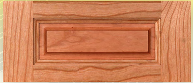
5-PIECE DRAWER FRONT Minimum Height: 6" with 1-1/2" Rails

Construction Method: Cope-N-Stick Outside Edge Detail: OD-6 (Square No Lip) Inside Edge Detail: Astron Panel Detail: Arroyo Minimum Width: 7-1/2" Minimum Height: 7-1/2" Max Width: 26" Max Height: 72"