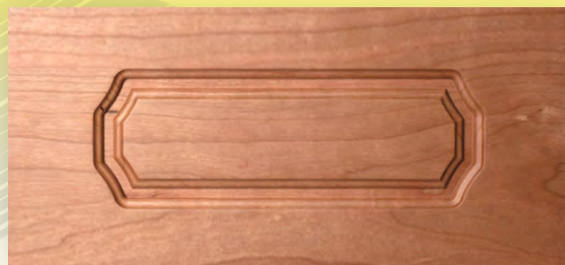
ROUTED DRAWER FRONT Minimum Height: 4-1/2"

Construction Method: Cope-N-Stick Outside Edge Detail: OD-6 (Square No Lip) Inside Edge Detail: Astron Panel Detail: 1/4" Recessed Minimum Width: 9" Minimum Height: 8-1/4" Max Width: 26" Max Height: 72"