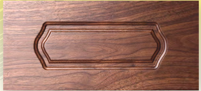
ROUTED DRAWER FRONT Minimum Height: 4-1/2"

Construction Method: Cope-N-Stick Outside Edge Detail: OD-6 (Square No Lip) Inside Edge Detail: Priscilla Panel Detail: Ogee Minimum Width: 9" Minimum Height: 9-1/2" Max Width: 26" Max Height: 72"