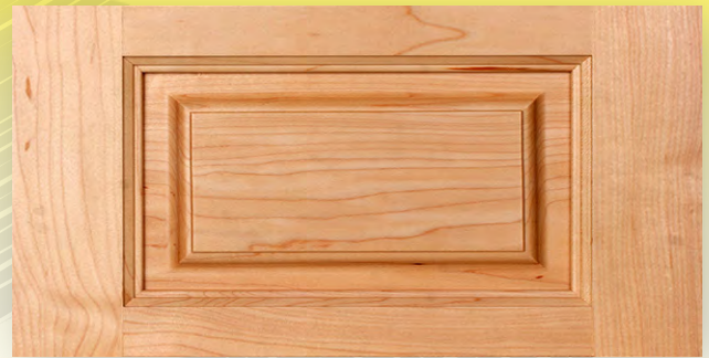
5-PIECE DRAWER FRONT Minimum Height: 6" with 1-1/2" Rails

Construction Method: Cope-N-Stick Outside Edge Detail: OD-6 (Square No Lip) Inside Edge Detail: Brooks Panel Detail: P1 Minimum Width: 8" Minimum Height: 8" Max Width: 26" Max Height: 72"