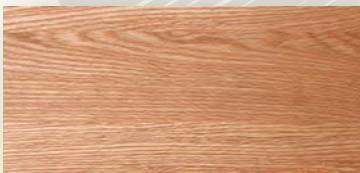
SOLID SLAB Minimum Height: 4-1/2"

*SPECIFICATIONS AND DETAILS SHOWN ARE SUBJECT TO CHANGE.