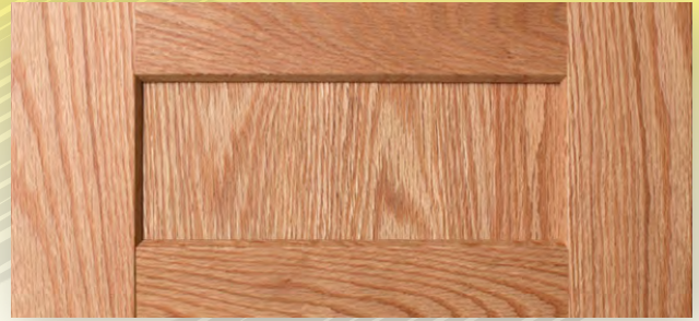
5-PIECE DRAWER FRONT Minimum Height: 6" with 1-1/2" Rails

Construction Method: Cope-N-Stick Outside Edge Detail: OD-6 (Square No Lip) Inside Edge Detail: CS-467 Panel Detail: Solid Recessed Minimum Width: 7-1/2" Minimum Height: 7-1/2" Max Width: 26" Max Height: 72"