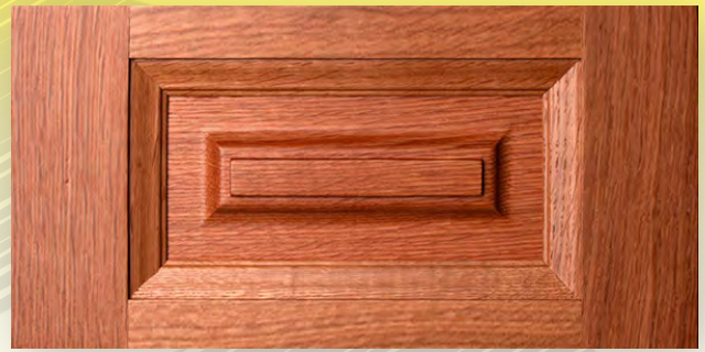
5-PIECE DRAWER FRONT (Order As Bahia) Minimum Height: 6-1/2" with 1-3/4" Rails

Construction Method: Cope-N-Stick Outside Edge Detail: OD-6 (Square No Lip) Inside Edge Detail: Sequoia Panel Detail: Bahia Minimum Width: 10-1/2" Minimum Height: 12" Max Width: 26" Max Height: 72"