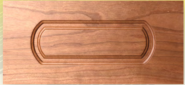
ROUTED DRAWER FRONT Minimum Height: 4-1/2"

Construction Method: Cope-N-Stick Outside Edge Detail: OD-6 (Square No Lip) Inside Edge Detail: Priscilla Panel Detail: Ogee Minimum Width: 9" Minimum Height: 9" Max Width: 26" Max Height: 72"