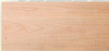
SOLID SLAB Minimum Height: 4-1/2"

*SPECIFICATIONS AND DETAILS SHOWN ARE SUBJECT TO CHANGE.