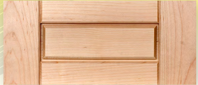
5-PIECE DRAWER FRONT Minimum Height: 6" with 1-1/2" Rails

Construction Method: Cope-N-Stick Outside Edge Detail: OD-6 (Square No Lip) Inside Edge Detail: Scottsdale (Groove On Rails) Panel Detail: Alexis Minimum Width: 7-1/2" Minimum Height: 7-1/2" Max Width: 26" Max Height: 72"