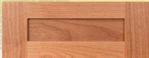
5-PIECE DRAWER FRONT (Order as MADISON) Minimum Height: 6" with 1-1/2" Rails

Construction Method: Cope-N-Stick Outside Edge Detail: OD-6 (Square No Lip) Inside Edge Detail: Ashley Panel Detail: 1/4" Recessed Minimum Width: 11-1/2" Minimum Height: 7" Max Width: 26" Max Height: 72"