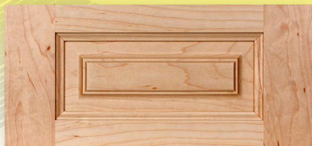
5-PIECE DRAWER FRONT Minimum Height: 6" with 1-1/2" Rails

Construction Method: Cope-N-Stick Outside Edge Detail: OD-6 (Square No Lip) Inside Edge Detail: Astron Panel Detail: Elite Minimum Width: 8" Minimum Height: 8" Max Width: 26" Max Height: 72"