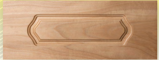
ROUTED DRAWER FRONT Minimum Height: 4-1/2"

Construction Method: Cope-N-Stick Outside Edge Detail: OD-6 (Square No Lip) Inside Edge Detail: Astron Panel Detail: Astron Minimum Width: 9" Minimum Height: 9-1/2" Max Width: 26" Max Height: 72"