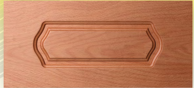
ROUTED DRAWER FRONT Minimum Height: 4-1/2"

Construction Method: Cope-N-Stick Outside Edge Detail: OD-6 (Square No Lip) Inside Edge Detail: Astron Panel Detail: Huntington Minimum Width: 9" Minimum Height: 9-1/2" Max Width: 26" Max Height: 72"