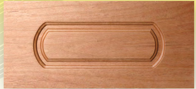
ROUTED DRAWER FRONT Minimum Height: 4-1/2"

Construction Method: Cope-N-Stick Outside Edge Detail: OD-6 (Square No Lip) Inside Edge Detail: Priscilla Panel Detail: Huntington Minimum Width: 9" Minimum Height: 9" Max Width: 26" Max Height: 72"