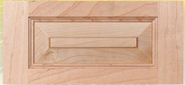
5-PIECE DRAWER FRONT (Order As Astron) Minimum Height: 6" with 1-1/2" Rails

Construction Method: Cope-N-Stick Outside Edge Detail: OD-6 (Square No Lip) Inside Edge Detail: Astron Panel Detail: Astron Minimum Width: 9-1/2" Minimum Height: 9-3/4" Max Width: 26" Max Height: 72"