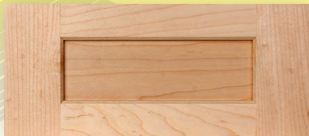
5-PIECE DRAWER FRONT Minimum Height: 6" with 1-1/2" Rails

Construction Method: Cope-N-Stick Outside Edge Detail: OD-6 (Square No Lip) Inside Edge Detail: Scottsdale Panel Detail: 1/4" Recessed Minimum Width: 7" Minimum Height: 7" Max Width: 26" Max Height: 72"