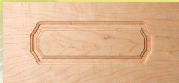
ROUTED DRAWER FRONT Minimum Height: 4-1/2"

Construction Method: Cope-N-Stick Outside Edge Detail: OD-6 (Square No Lip) Inside Edge Detail: Astron Panel Detail: Ogee Minimum Width: 9" Minimum Height: 9-1/4" Max Width: 26" Max Height: 72"