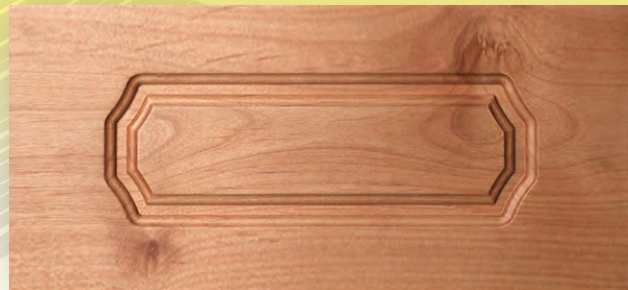
ROUTED DRAWER FRONT Minimum Height: 4-1/2"

Construction Method: Cope-N-Stick Outside Edge Detail: OD-6 (Square No Lip) Inside Edge Detail: Priscilla Panel Detail: Ogee Minimum Width: 9" Minimum Height: 9" Max Width: 26" Max Height: 72"