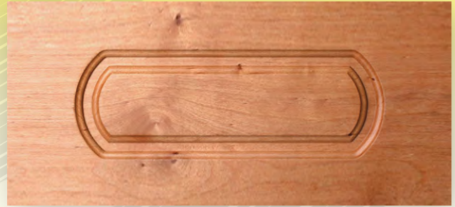
ROUTED DRAWER FRONT Minimum Height: 4-1/2"

Construction Method: Cope-N-Stick Outside Edge Detail: OD-6 (Square No Lip) Inside Edge Detail: Astron Panel Detail: Ogee Minimum Width: 9" Minimum Height: 9-1/2" Max Width: 26" Max Height: 72"