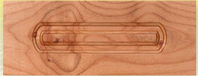
ROUTED DRAWER FRONT Minimum Height: 4-1/2"

Construction Method: Cope-N-Stick Outside Edge Detail: OD-6 (Square No Lip) Inside Edge Detail: Astron Panel Detail: Astron Minimum Width: 9" Minimum Height: 9" Max Width: 26" Max Height: 72"