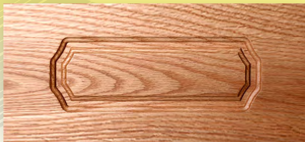
ROUTED DRAWER FRONT Minimum Height: 4-1/2"

Construction Method: Cope-N-Stick Outside Edge Detail: OD-6 (Square No Lip) Inside Edge Detail: Astron Panel Detail: Huntington Minimum Width: 9" Minimum Height: 9-1/4" Max Width: 26" Max Height: 72"