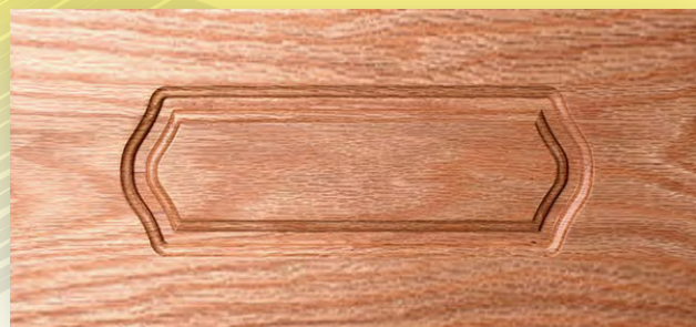
ROUTED DRAWER FRONT Minimum Height: 4-1/2"

Construction Method: Cope-N-Stick Outside Edge Detail: OD-6 (Square No Lip) Inside Edge Detail: Priscilla Panel Detail: Huntington Minimum Width: 9" Minimum Height: 9-1/2" Max Width: 26" Max Height: 72"