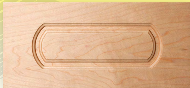
ROUTED DRAWER FRONT Minimum Height: 4-1/2"

Construction Method: Cope-N-Stick Outside Edge Detail: OD-6 (Square No Lip) Inside Edge Detail: Priscilla Panel Detail: Astron Minimum Width: 9" Minimum Height: 9" Max Width: 26" Max Height: 72"