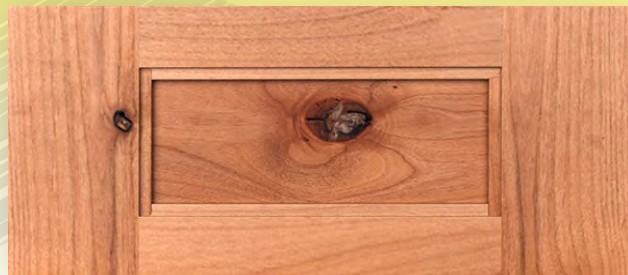
5-PIECE DRAWER FRONT