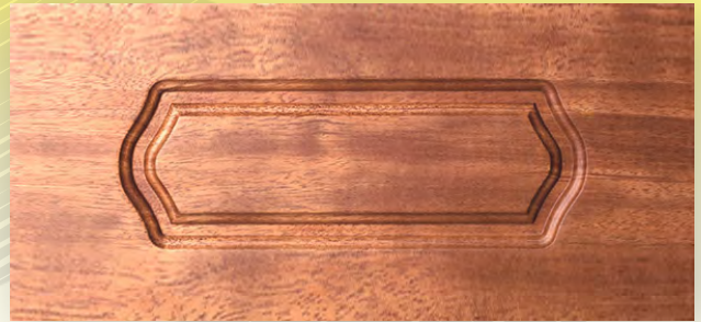
ROUTED DRAWER FRONT

Construction Method: Cope-N-Stick Outside Edge Detail: OD-6 (Square No Lip) Inside Edge Detail: Astron Panel Detail: Ogee Minimum Width: 9" Minimum Height: 9-1/2" Max Width: 26" Max Height: 72"