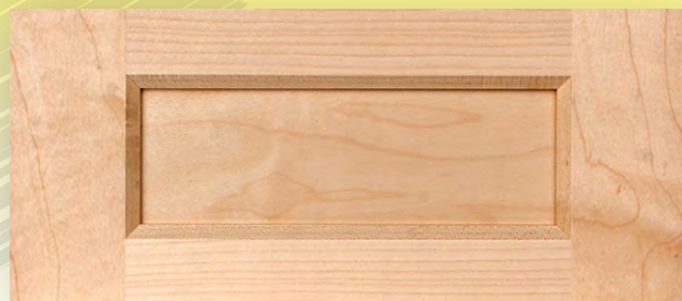
5-PIECE DRAWER FRONT Minimum Height: 6" with 1-1/2" Rails

Construction Method: Cope-N-Stick Outside Edge Detail: OD-6 (Square No Lip) Inside Edge Detail: Alexis Panel Detail: 1/4" Recessed Minimum Width: 7" Minimum Height: 7" Max Width: 26" Max Height: 72"