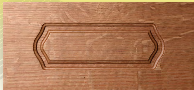
ROUTED DRAWER FRONT Minimum Height: 4-1/2"

Construction Method: Cope-N-Stick Outside Edge Detail: OD-6 (Square No Lip) Inside Edge Detail: Priscilla Panel Detail: 1/4" Recessed Minimum Width: 9" Minimum Height: 8-1/2" Max Width: 26" Max Height: 72"