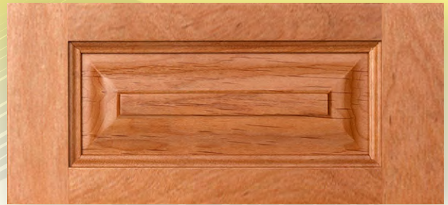
5-PIECE DRAWER FRONT Minimum Height: 6" with 1-1/2" Rails

Construction Method: Cope-N-Stick Outside Edge Detail: OD-6 (Square No Lip) Inside Edge Detail: Astron Panel Detail: Ogee Minimum Width: 7-1/2" Minimum Height: 7-1/2" Max Width: 26" Max Height: 72"