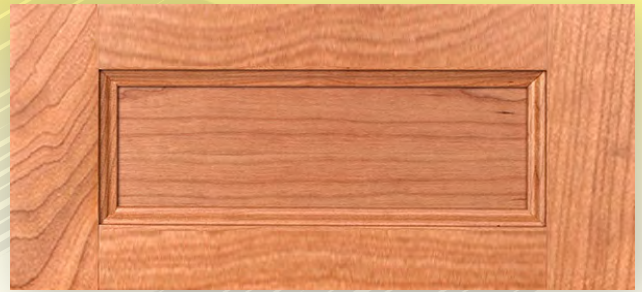
5-PIECE DRAWER FRONT Minimum Height: 6" with 1-1/2" Rails

Construction Method: Cope-N-Stick Outside Edge Detail: OD-6 (Square No Lip) Inside Edge Detail: Astron Panel Detail: 1/4" Recessed Minimum Width: 7" Minimum Height: 7" Max Width: 26" Max Height: 72"