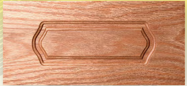
ROUTED DRAWER FRONT Minimum Height: 4-1/2"

Construction Method: Cope-N-Stick Outside Edge Detail: OD-6 (Square No Lip) Inside Edge Detail: Priscilla Panel Detail: Astron Minimum Width: 9" Minimum Height: 9-1/2" Max Width: 26" Max Height: 72"