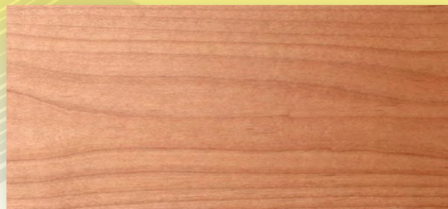
SLAB DRAWER FRONT Minimum Height: 4-1/2"

Construction Method: Cope-N-Stick Outside Edge Detail: OD-6 (Square No Lip) Inside Edge Detail: Ashley Panel Detail: Cabrillo Minimum Width: 8-1/2" Minimum Height: 8-1/2" Max Width: 30" Max Height: 72"