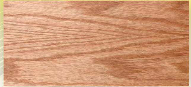
SLAB DRAWER FRONT Minimum Height: 4-1/2"

Construction Method: Cope-N-Stick Outside Edge Detail: OD-6 (Square No Lip) Inside Edge Detail: Ashley Panel Detail: Easton Minimum Width: 8-1/2" Minimum Height: 8-1/2" Max Width: 30" Max Height: 72"