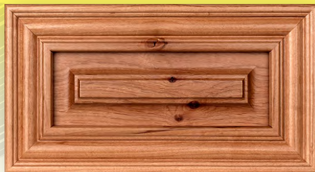
5-PIECE DRAWER FRONT