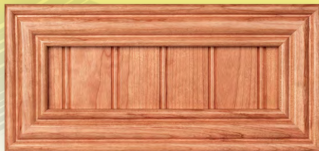
5-PIECE DRAWER FRONT