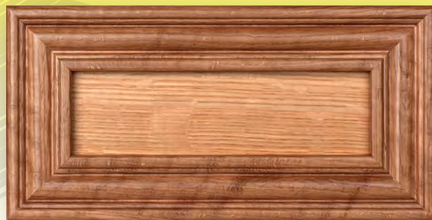
5-PIECE DRAWER FRONT

Construction Method: Mitered Outside Edge Detail: OD-5 (3/8" Bullnose No Lip) Inside Edge Detail: Diplomat Panel Detail: 1/4" Recessed Minimum Width: 9" Minimum Height: 9" Max Width: 26" Max Height: 72"