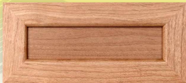
5-PIECE DRAWER FRONT Minimum Height: 6" with 1-3/4" Frame

Construction Method: Mitered Outside Edge Detail: OD-6 (Square No Lip) Inside Edge Detail: Sunset Panel Detail: 1/4" Recessed Minimum Width: 7" Minimum Height: 7" Max Width: 26" Max Height: 72"