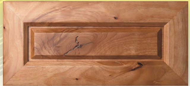
5-PIECE DRAWER FRONT Minimum Height: 6" with 1-3/4" Frame

Construction Method: Mitered Outside Edge Detail: OD-20 (Laguna No Lip) Inside Edge Detail: Alexis Panel Detail: Alexis Minimum Width: 7-1/2" Minimum Height: 7-1/2" Max Width: 26" Max Height: 72"