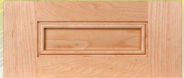
5-PIECE DRAWER FRONT Minimum Height: 6" with 1-1/2" Rails

Construction Method: Cope-N-Stick Outside Edge Detail: OD-6 (Square No Lip) Inside Edge Detail: Apple Panel Detail: 1/4" Recessed Minimum Width: 8" Minimum Height: 8" Max Width: 26" Max Height: 72"