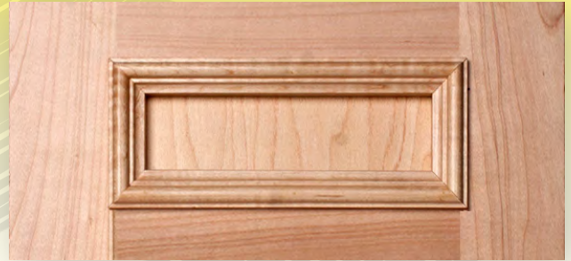
5-PIECE DRAWER FRONT Minimum Height: 6" with 1-1/2" Rails

Construction Method: Cope-N-Stick Outside Edge Detail: OD-6 (Square No Lip) Inside Edge Detail: Ashley w/ Cascade Moulding Panel Detail: 1/4" Recessed Minimum Width: 7-1/2" Minimum Height: 7-1/2" Max Width: 26" Max Height: 72"