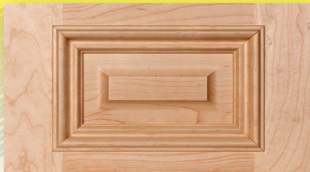
5-PIECE DRAWER FRONT Minimum Height: 8" with 1-1/2" Rails

Construction Method: Cope-N-Stick Outside Edge Detail: OD-6 (Square No Lip) Inside Edge Detail: Ashley w/ MLD-33 Moulding Panel Detail: Hartford Big Minimum Width: 10" Minimum Height: 10" Max Width: 26" Max Height: 72"