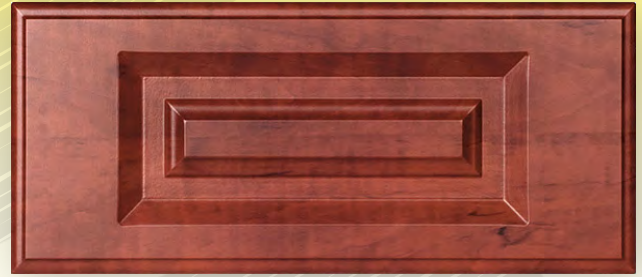
ROUTED DRAWER FRONT

Construction Method: CNC Machined w/ MDF Core Outside Edge Detail: CF-2 Route Detail: CM 530 Minimum Width: 8" Minimum Height: 8" Max Width: 36" Max Height: 72"