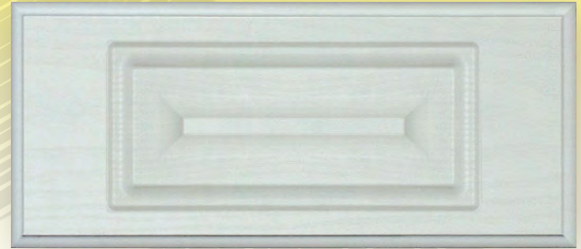
ROUTED DRAWER FRONT (Order As CM 742) Minimum Height: 7-1/4" with 1-3/4" Rails

Construction Method: CNC Machined w/ MDF Core Outside Edge Detail: CF-2 Route Detail: CM 742 w/ Cathedral Arch Minimum Width: 10-1/2" Minimum Height: 10" Max Width: 36" Max Height: 72"