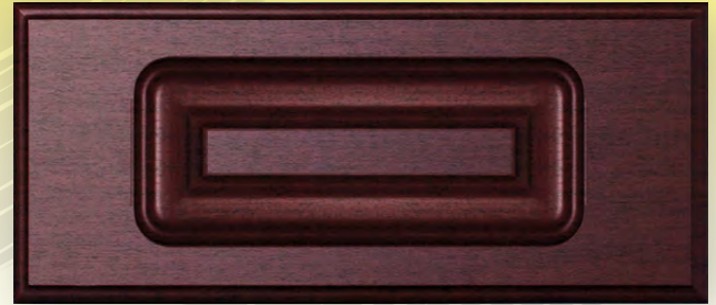
ROUTED DRAWER FRONT (Order As CM 785) Minimum Height: 5-1/2" with 1-3/4" Rails

Drawer Fronts come with horizontal grain as STANDARD.